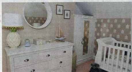
MASTERFUL TOUCHES: Top, the master bedroom with bedside tables from Okia; below, Leo's bedroom with furniture from John Lewis and Thibaut turtle wallpaper.

properties on what local estate agents refer to as "the favoured south side of Harrogate".